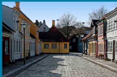
The House of Hans Christian Andersen