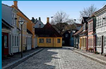
The House of Hans Christian Andersen