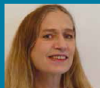
Dear Colleagues and Friends,

World Council for Gifted and Talented Children www.worldgifted2015.com